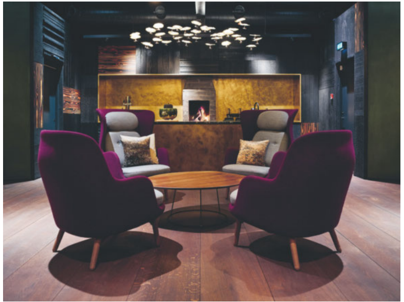
↑ Coffee, tea, cakes and cocktails are served on the "balcony".